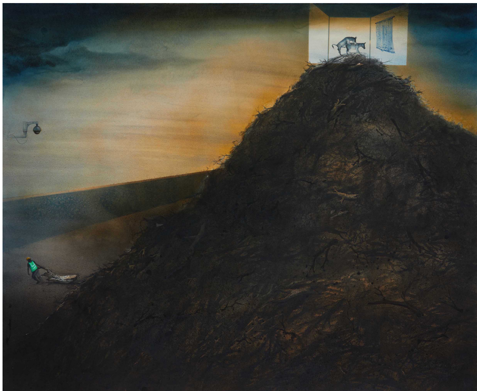
Bholanath Rudra You're under CCTV Surveillance Watercolour on paper 58.6 x 72 inches 2020, Kolkata C5330