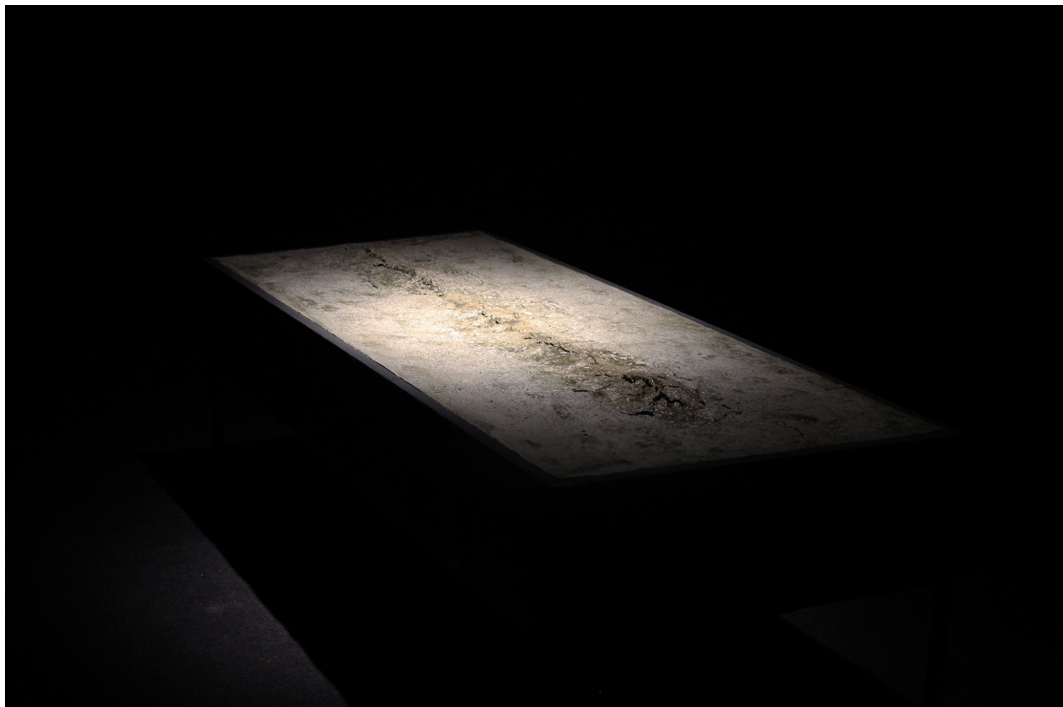
Debasis Barui An Unaccustomed Earth Iron, china clay, latex and mechanical gadgets 72 x 28 x 24 inches 2020, Kolkata C5746