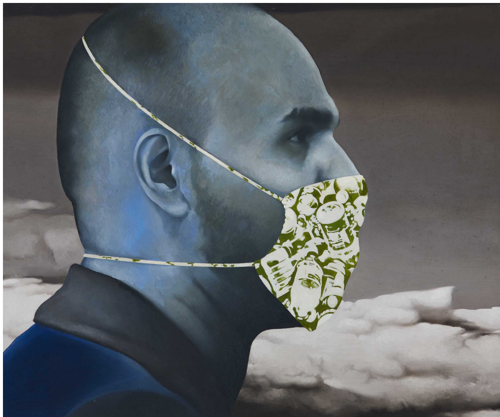
Snehasish Maity In between Oil on canvas 40 x 48 inches 2018, Kolkata C5739