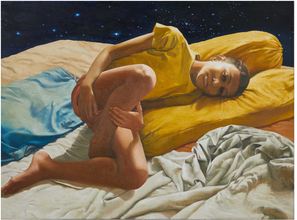
Snehasish Maity A Young Astronaut Oil on canvas 80 x 60 inches 2020, Kolkata C5738