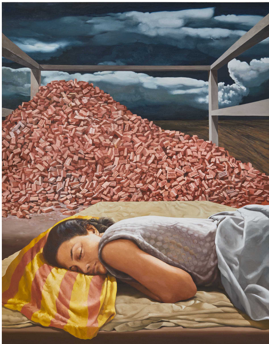
Snehasish Maity Beyond it, the Blue Air Oil on canvas 82 x 64 inches 2020, Kolkata C5740