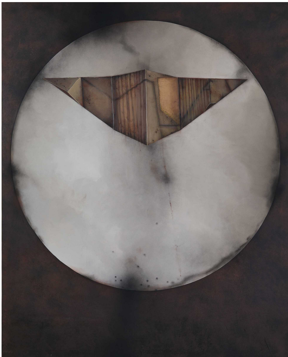
Suman Dey Space and Possibility Acrylic and charcoal on canvas 72 x 90 inches 2020, Kolkata C5455