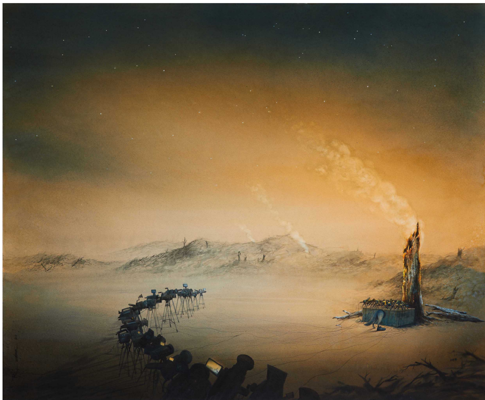
Bholanath Rudra Press Conference Watercolour on paper 58.6 x 72 inches 2020, Kolkata C5331