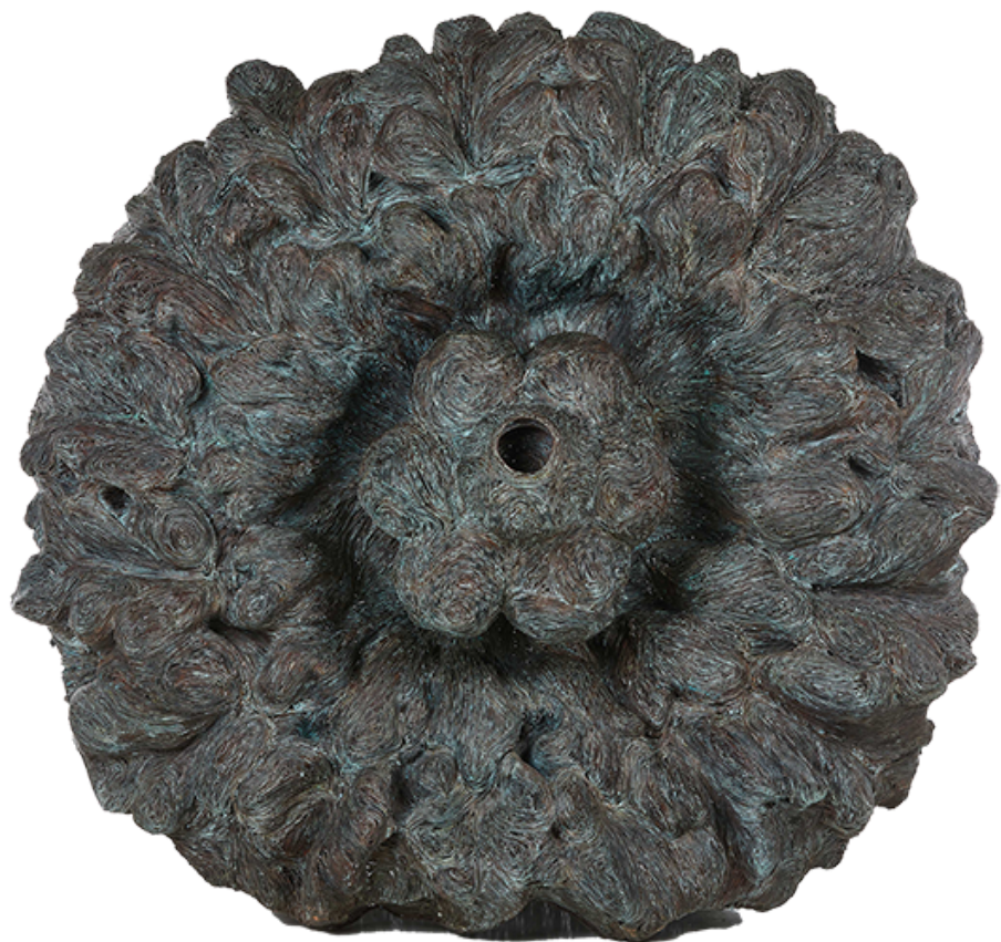
Tapas Biswas Flower becomes Fossilized Copper 54 x 56 x 42 inches 2018, Kolkata C5743