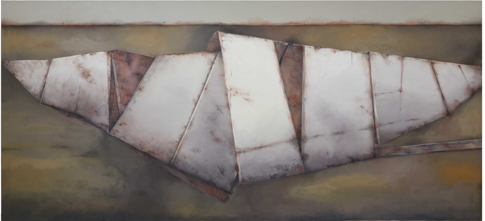
Suman Dey At the End Acrylic and charcoal on canvas 60 x 132 inches 2020, Kolkata C5457