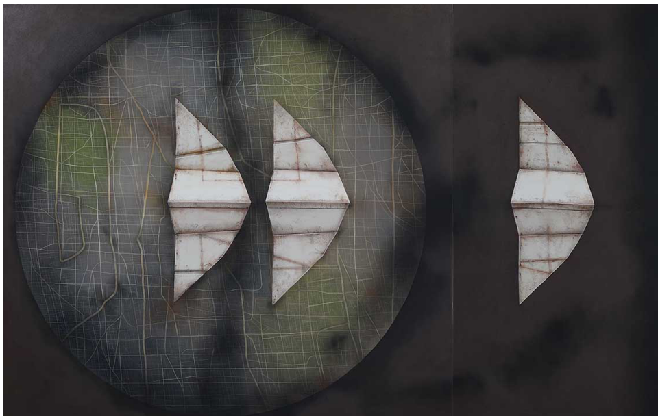
Suman Dey Journey II Acrylic and charcoal on canvas 72 x 114 inches 2020, Kolkata C5453