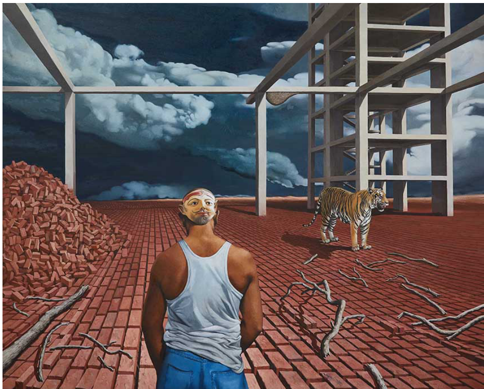
Snehasish Maity Power, Memory, Architecture Oil on canvas 90 x 72 inches 2020, Kolkata C5741