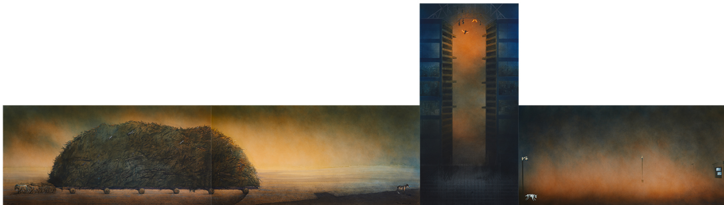
Bholanath Rudra Plantation Watercolour on paper 138 x 324 inches 2020, Kolkata C5332