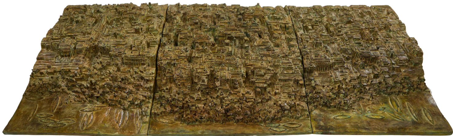
Tapas Biswas Varanasi Bronze 76.5 x 32 x 7 inches 2020, Kolkata C5745