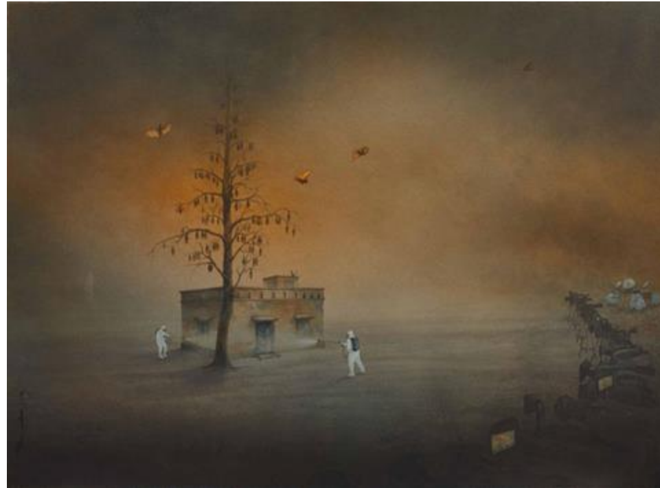
Evening light Watercolour on paper 44 x 59.5 in. 2020