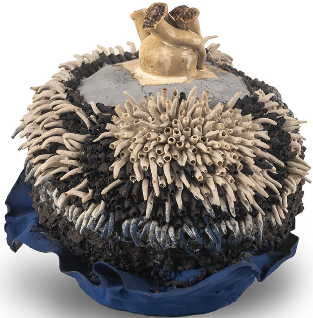
Terra's Sprout Natural pulp clay Overall dimension variable Set of 3 works 2024, Santiniketan