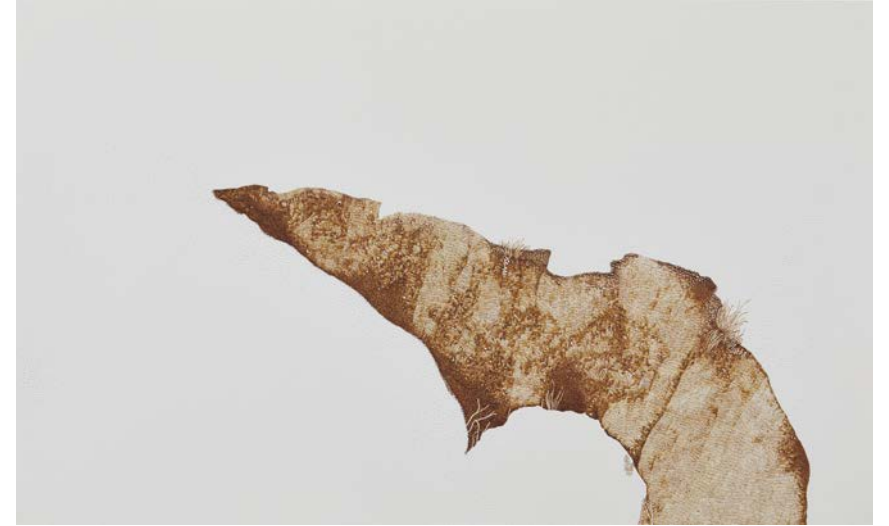
View from the Canal at Sonajhuri Pen, ink and pin work on paper 17 x 10 inches 2022