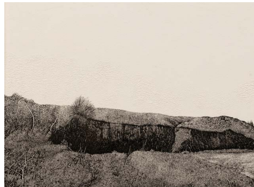
In the Vicinity of Santiniketan VI Pen, ink and pin-work on paper 11 x 16.5 inches 2023