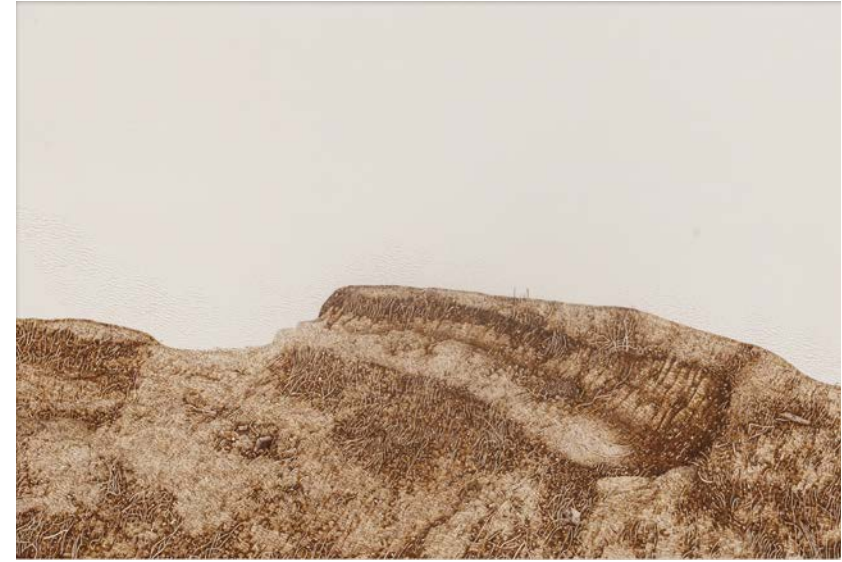
In the Vicinity of Santiniketan I Pen, ink and pin-work on paper 11 x 16.5 inches 2023