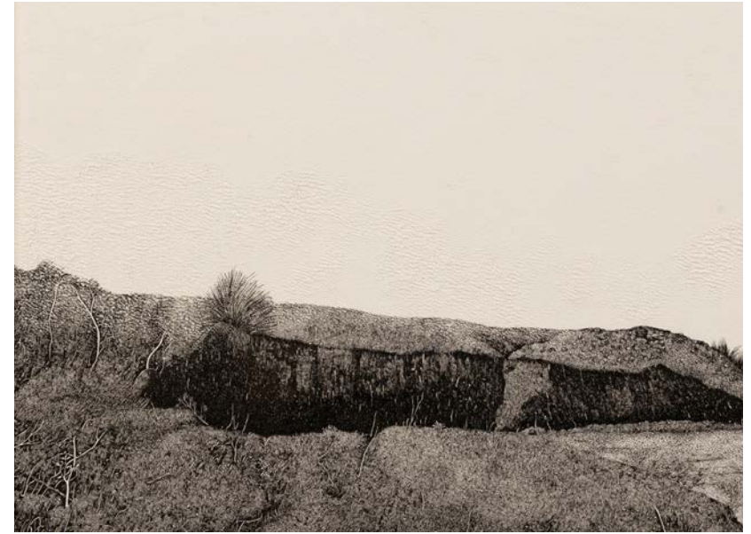
In the Vicinity of Santiniketan V Pen, ink and pin-work on paper 11 x 16.5 inches 2023