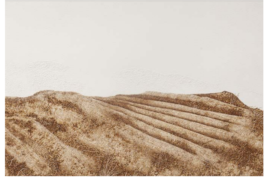
In the Vicinity of Santiniketan IV Pen, ink and pin-work on paper 11 x 16.5 inches 2023