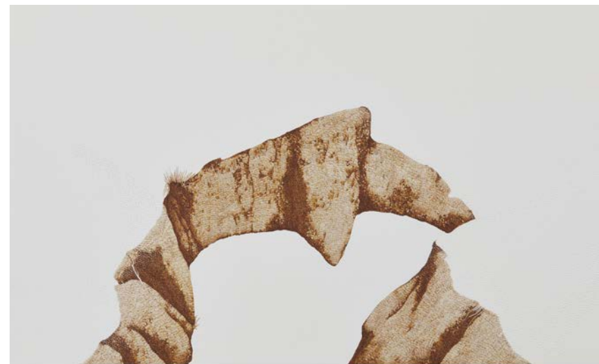
View from the Canal at Sonajhuri Pen, ink and pin work on paper 17 x 10 inches 2022