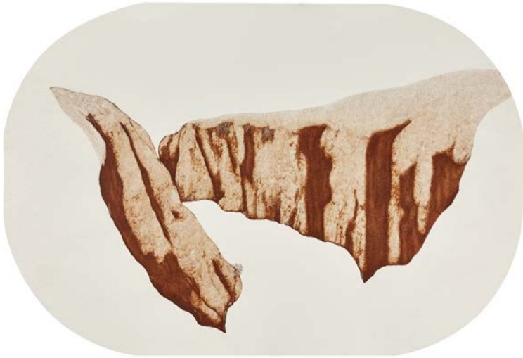
View from the Canal at Sonajhuri I Pen, ink and pinprick on paper 30 X 44 inches 2022