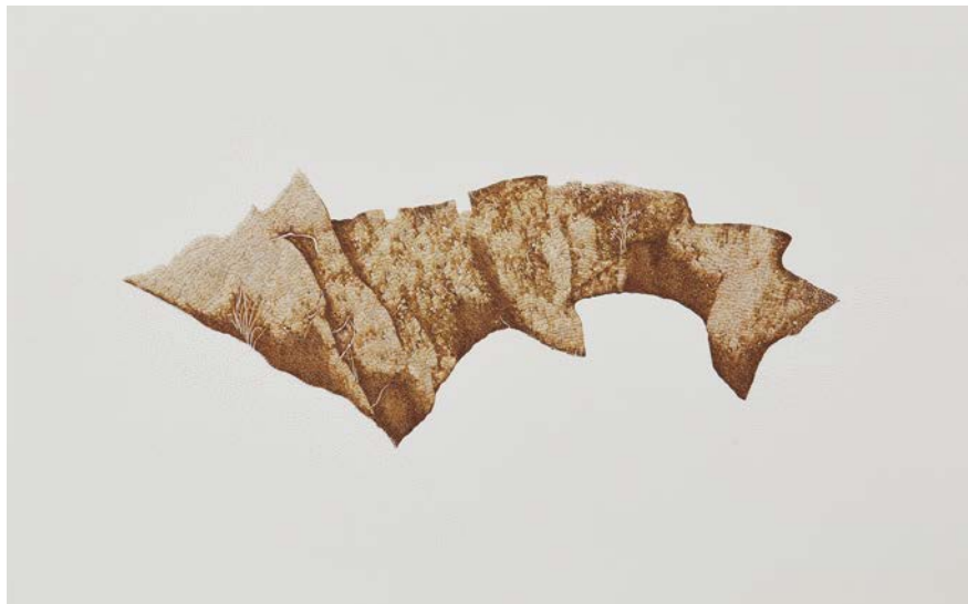
View from the Canal at Sonajhuri Pen, ink and pin work on paper 17 x 10 inches 2022