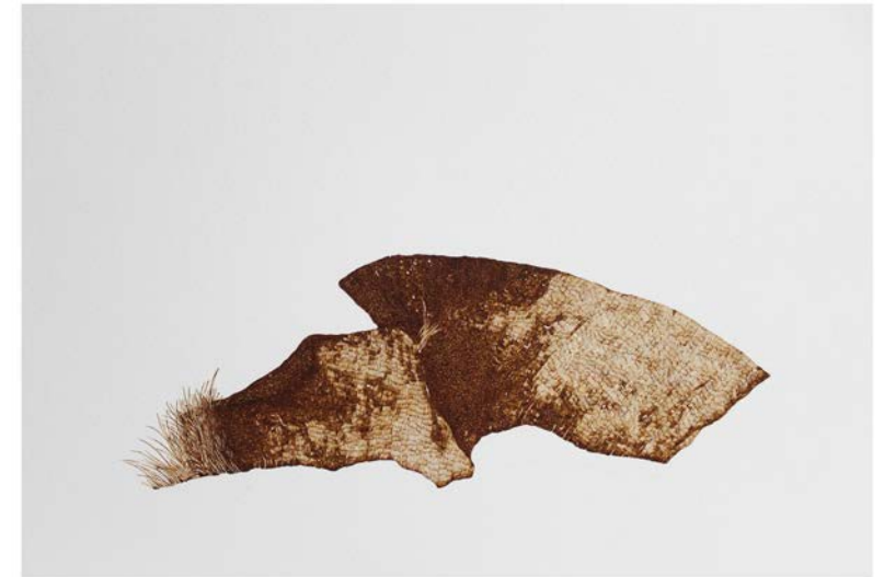
Excoration Pen, ink and pin work with needle 8 x 24 inches overall 2022