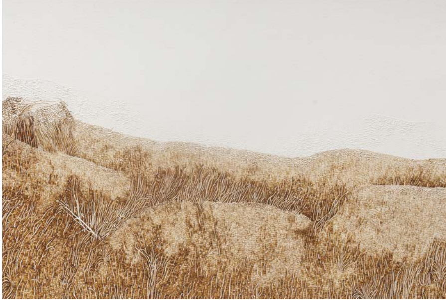
In the Vicinity of Santiniketan III Pen, ink and pin-work on paper 11 x 16.5 inches 2023