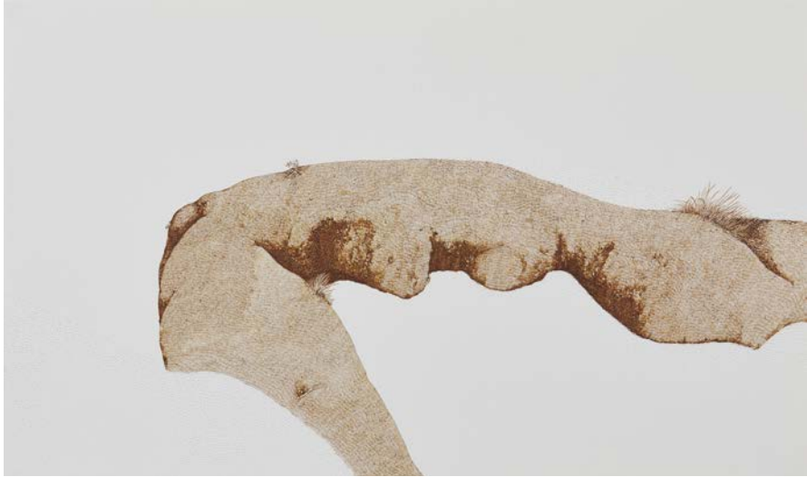
View from the Canal at Sonajhuri Pen, ink and pin work on paper 17 x 10 inches 2022