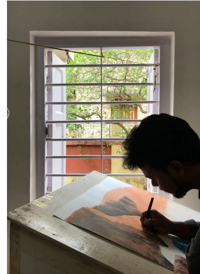
In the Studio