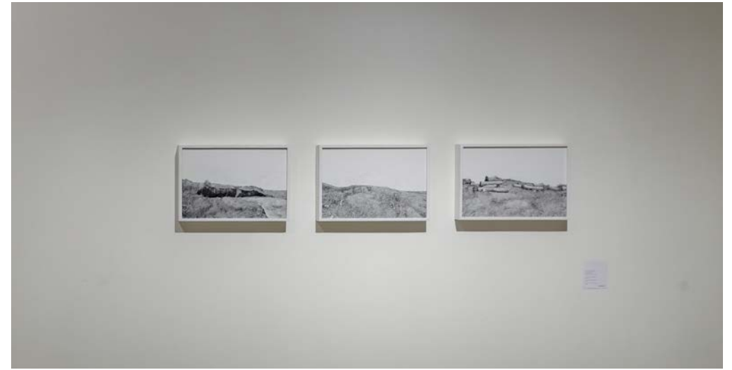
Installation view from 'All That is Hidden: Mapping Departures in Landscape, Terrains and Geographies' at Emami Art, Kolkata, 2024

Latua's departure from the conventional representation of Santiniketan's landscape epitomises a departure from the romanticised depictions that historically dominated artistic renderings of the locale. Through a meticulous dissection of the picturesque, Latua endeavours to interrogate the socio-political undercurrents pervading the terrain, thus transcending the mere portrayal of aesthetic beauty to delve into the intricate tapestry of power dynamics and environmental degradation. Emerging as a bastion of artistic and intellectual exchange over a century, Santiniketan has metamorphosed from a pristine and uninhabited expanse into a crucible of shared communal identity.