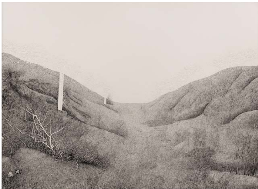
In the Vicinity of Birbhumi II Pen, ink and pin-work on paper 22 x 30 inches 2024