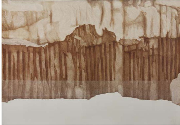
Excoriated Land Pen, ink and pricking with needle 42 x 59.5 inches 2018-19