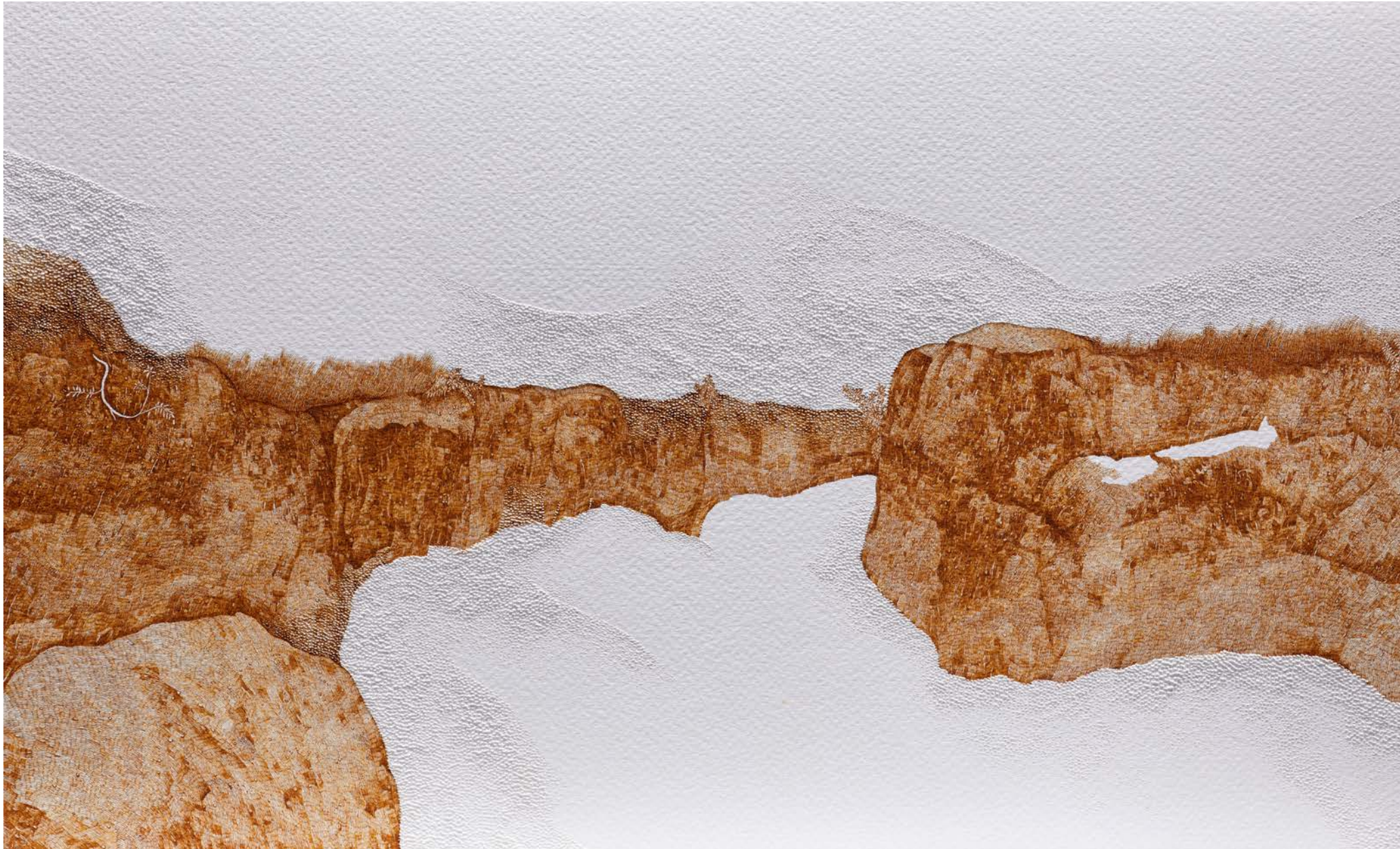
Khoai Landscape IV Pen, ink and pin-work on paper 10 x 16.5 inches 2020