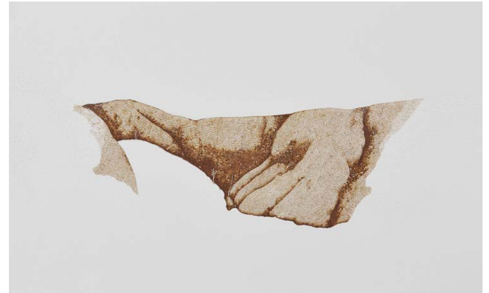
View from the Canal at Sonajhuri Pen, ink and pin work on paper 17 x 10 inches 2022