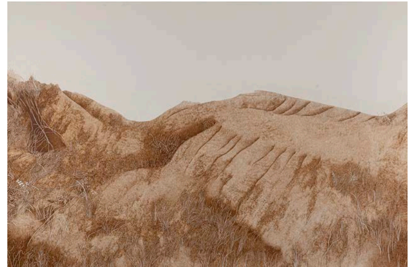
In the Vicinity of Birbhum I Pen, ink and pin-work on paper 45 x 69.5 inches 2024