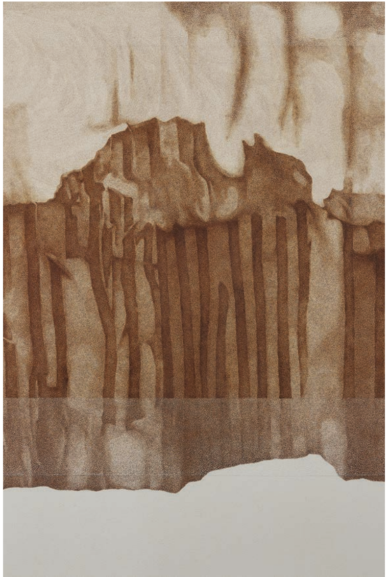
Ghana Shyam Latua