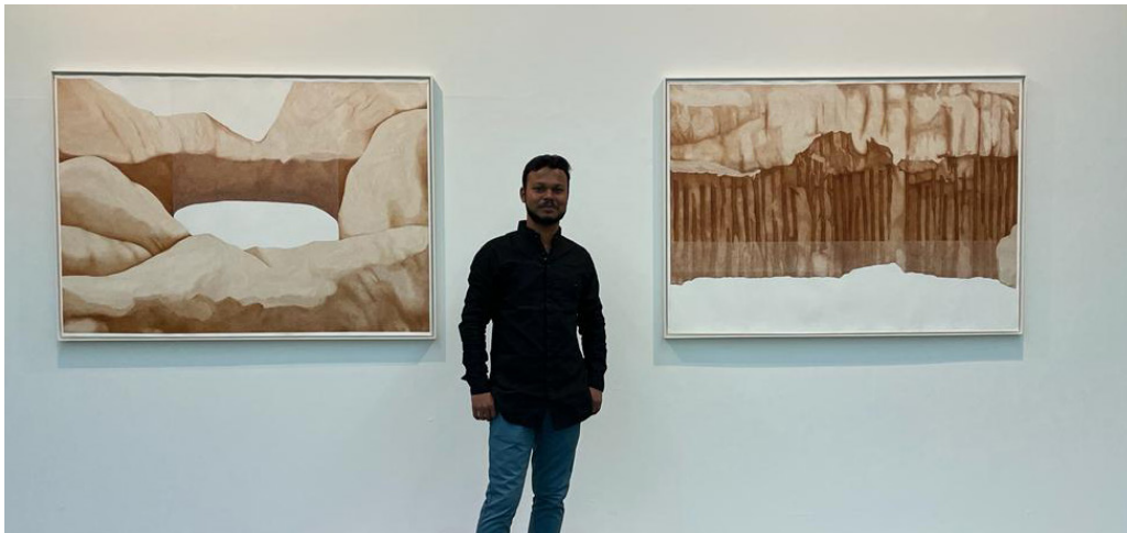
Installation view from 'The Lament of Red Earth', Leipzig, Germany, 2022

Latua's departure from the conventional representation of Santiniketan's landscape epitomises a departure from the romanticised depictions that historically dominated artistic renderings of the locale. Through a meticulous dissection of the picturesque, Latua endeavours to interrogate the socio-political undercurrents pervading the terrain, thus transcending the mere portrayal of aesthetic beauty to delve into the intricate tapestry of power dynamics and environmental degradation. Emerging as a bastion of artistic and intellectual exchange over a century, Santiniketan has metamorphosed from a pristine and uninhabited expanse into a crucible of shared communal identity.