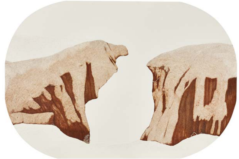
View from the Canal at Sonajhuri II Pen, ink and pinprick on paper 30 x 44 inches 2023