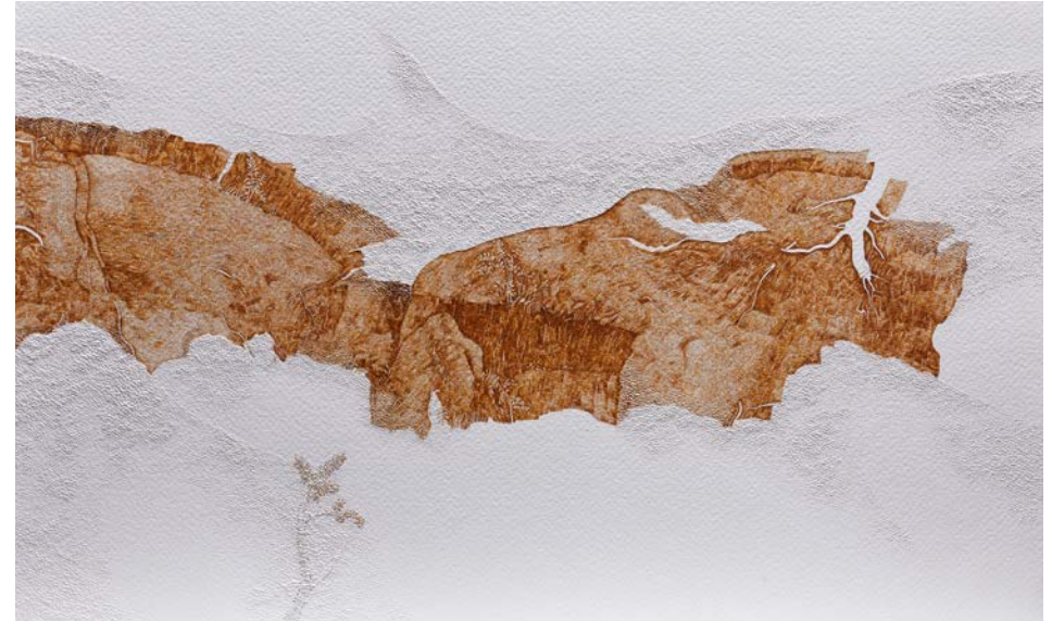
Khoai Landscape I Pen, ink and pin-work on paper 10 x 16.5 inches 2020

Khoai in Bengali refers to a lateritic landform in the Rarh region of Bengal, the eroded and arid land surrounding Santiniketan. Spreading to the horizon on all directions, the rural beauty of the vast, undulated and sparsely timbered Khoai attracted the early Santiniketan artists. They produced a large body of paintings and drawings, transforming the geographical features into a landscape trope, in which the scopic and aesthetic imagination of the self, place and nature are inextricably intertwined.