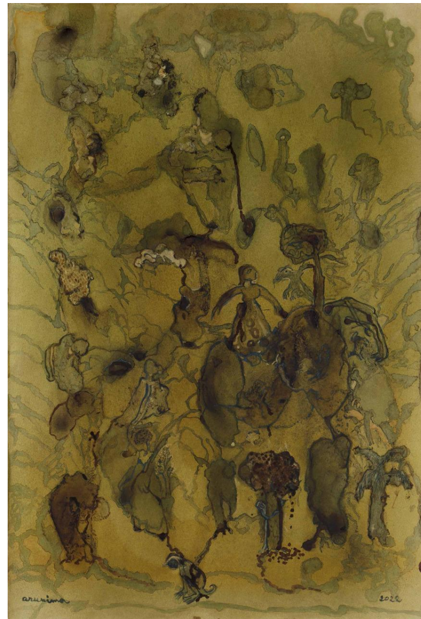
Landscape III Vegetable colour on handmade paper 43 x 30 in. (109.5 x 75 cm.) 2022 Kolkata