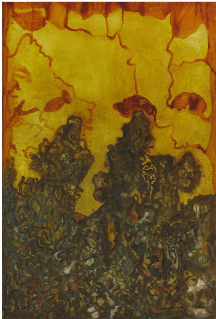
Landscape II Vegetable colour on handmade paper 43 x 29 in. (109 x 74.5 cm.) 2021 Kolkata